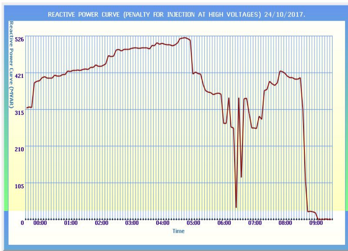
Figure-1: Reactive power injection by Delhi control area to NR grid causing Penalty